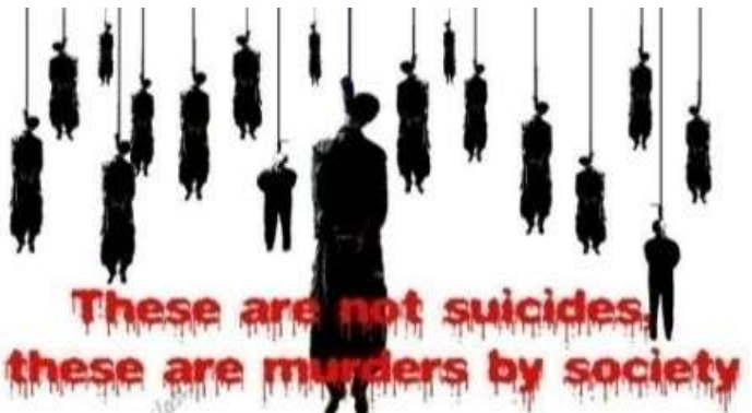
Gender Biased Laws pushing Indian Men to commit suicides. >65,000 kill themselves every year according to NCRB.